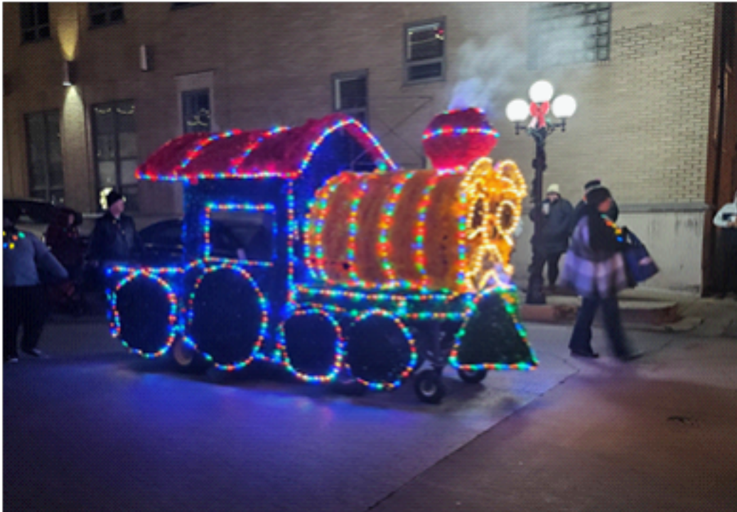
Train from the Light Parade wishing all a MERRY CHRISTMAS!!!

(Greater Livingston County Arts Council Newsletter)